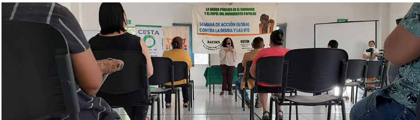
■ CESTA/Friends of the Earth El Salvador

On October 13th, CESTA/Friends of the Earth El Salvador held a Public Forum on “Public Debt in El Salvador and the Role of the Popular Movement”, in coordination with RACDES. The activity was convened as part of the Global Week of Action Against Debt and IFIs.