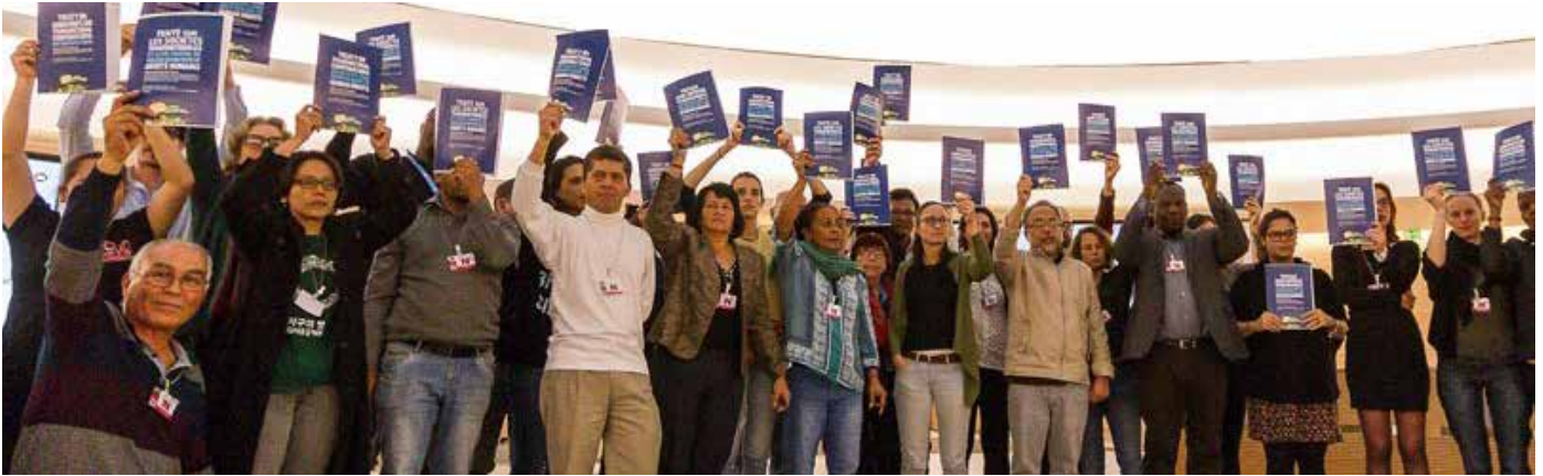
■ Friends of the Earth International

On Wednesday, October 21st Friends of the Earth International (FoEI) organized a webinar in collaboration with ATALC to discuss the main points that the Federation would bring for discussion and positioning to the sixth round of negotiations for a Binding Treaty on transnational corporations and human rights that took place in Geneva, Switzerland, October 26 to 30th. The webinar addressed the challenges ahead in the process of building a strong Binding Treaty with an ambitious scope, which can become a reference point to end the corporate impunity enjoyed by transnational corporations.