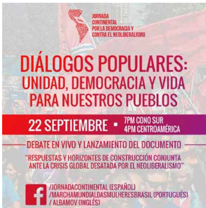
Continental Platform for Democracy and against Neoliberalism

This public debate featuring representatives from several of the popular organizations that make up the Continental Platform also served as venue for launching its document “Responses and horizons of joint construction in the face of the global crisis unleashed by neoliberalism” . In addition, the common agenda of activities and mobilizations for October and November was presented.